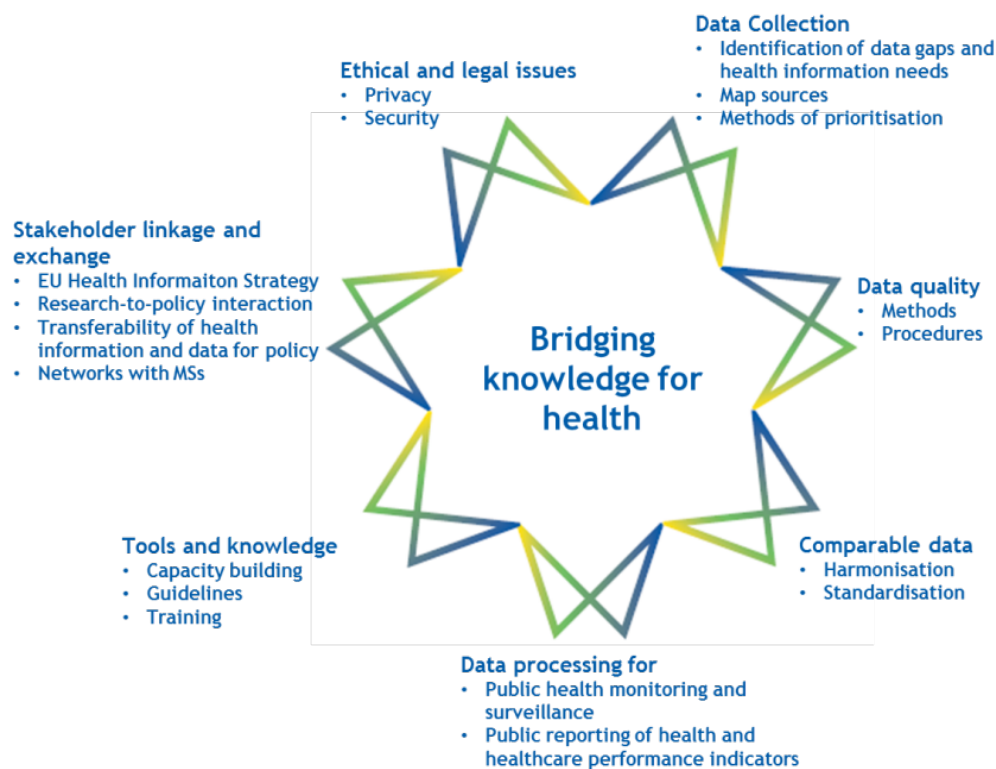
Figure 3. Potential branches of activities carried out by an EU health information system